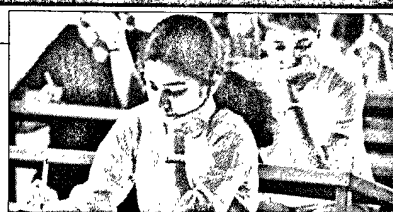
परीक्षा देती छात्राओं की काइल कोटी।

दिल्ली आईआईटी फैकल्टी फेडरेशन के अध्यक्ष