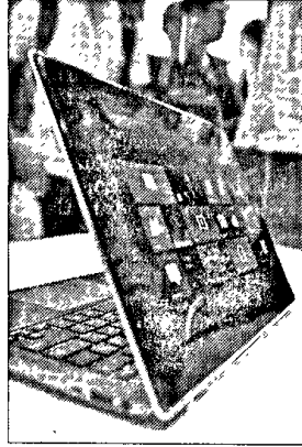
TWO FACED: Taichi's dual screens run different applications at same time.

One tablet-ultrabook convertible that garnered attention was